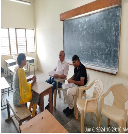
Jun 6, 2024 10:29:10 AM