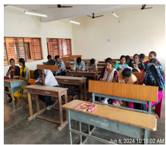
Jun 6, 2024 10:18:02 AM