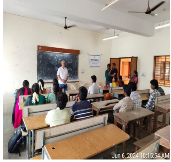
Jun 6, 2024 10:15:54 AM